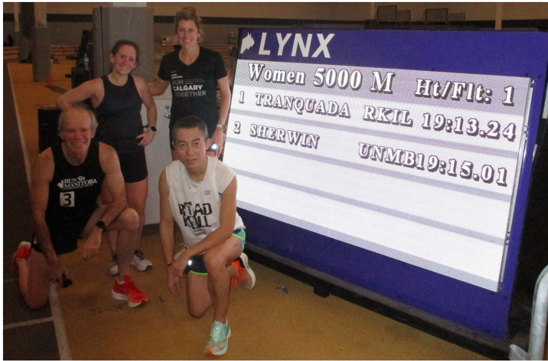
WOA Winter Classic – Masters 5000M Participants