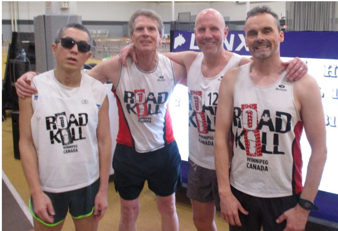
WOA Winter Classic – Roadkill 4x200