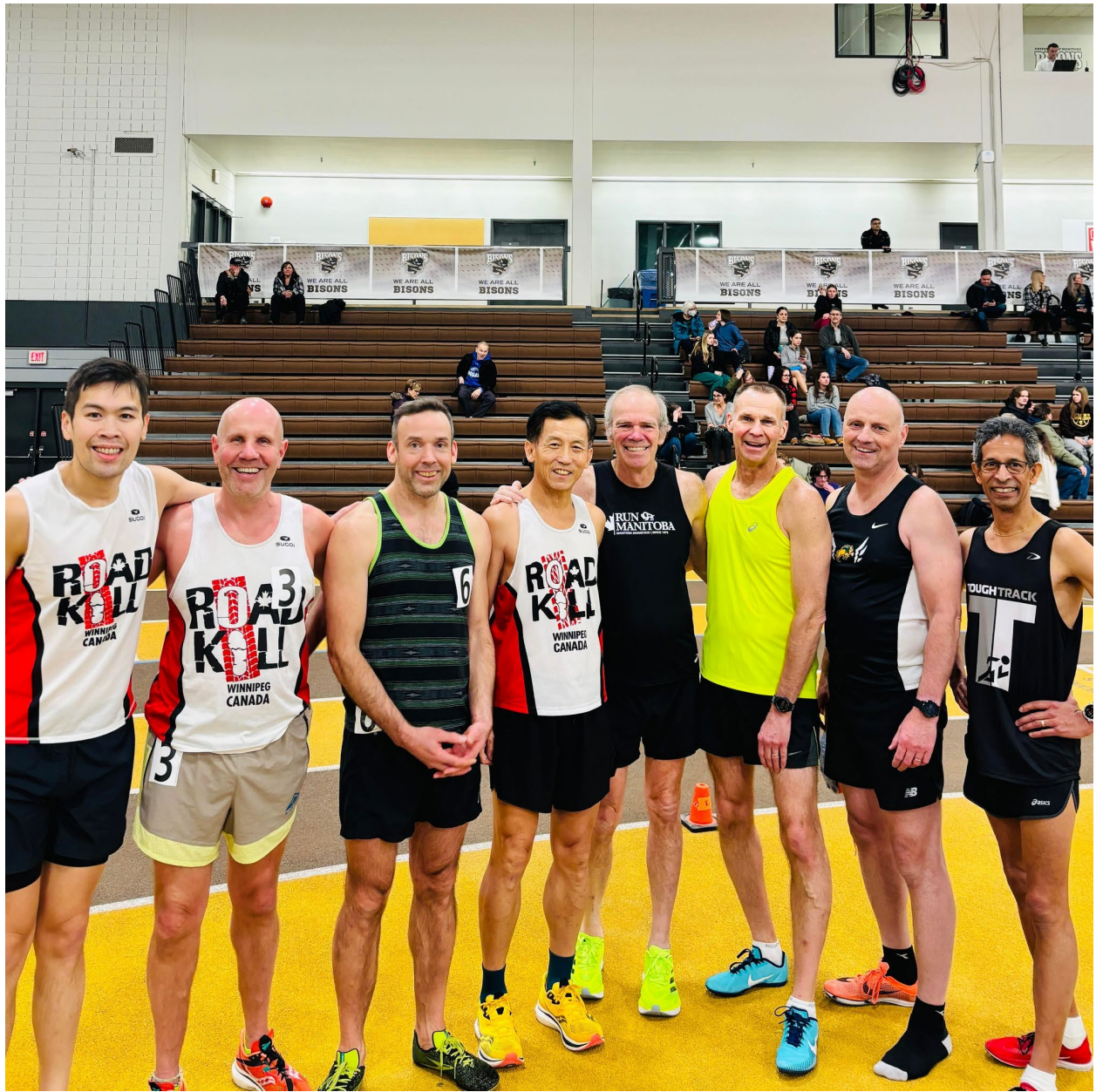
Bison Grand Prix #1 – 4x200 Masters Relay teams